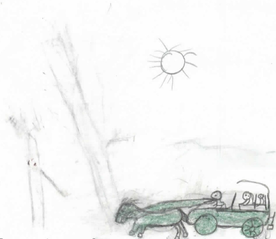
Draw a picture of some visitors who have come to Jamaica from far away.

If you would like to explain your drawing, use this space.